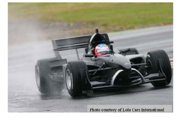
Current supplier to LOLA CARS INTERNATIONAL