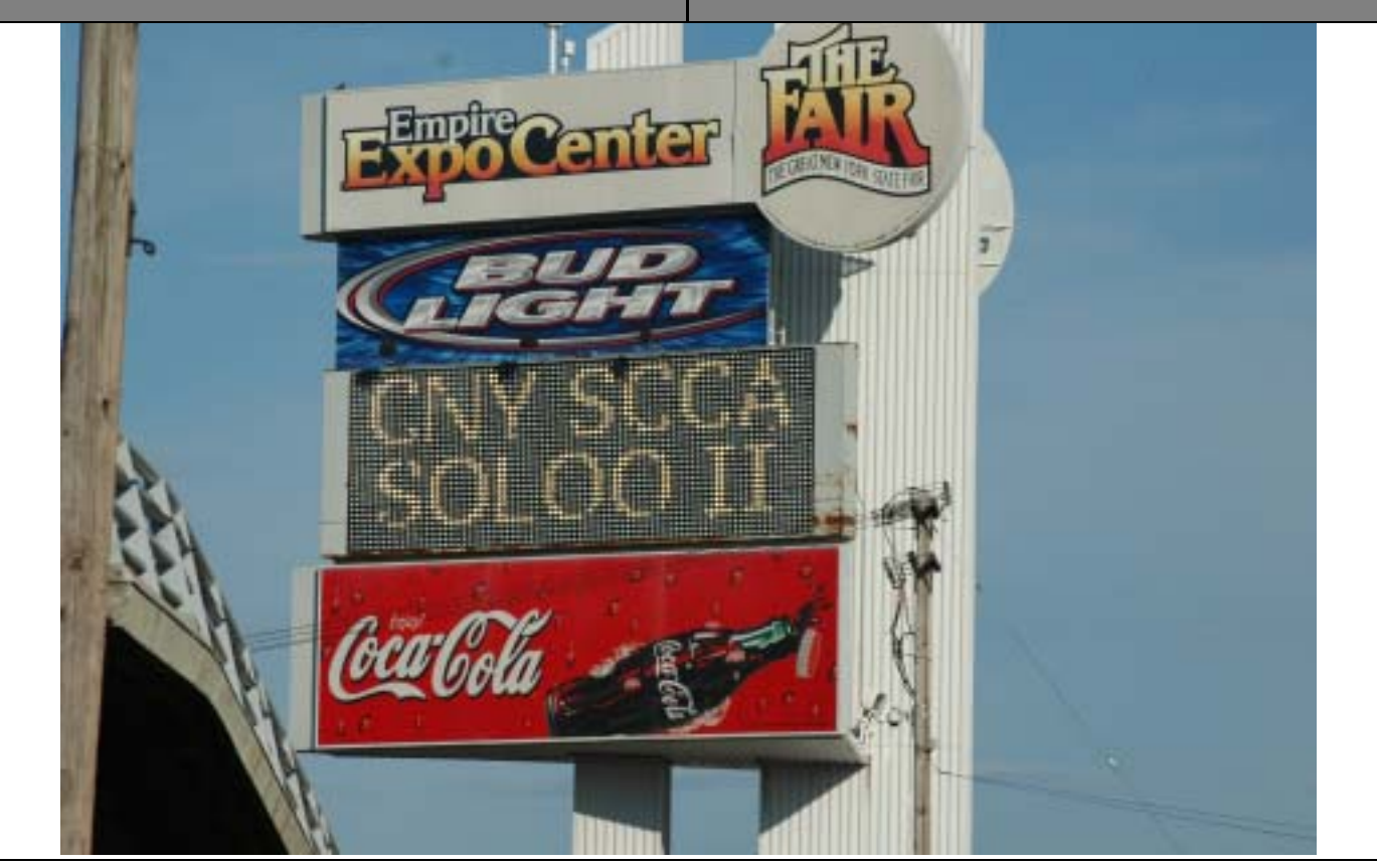
A Marquee Event at the Fair (Very Cool, but what's a SOLOO?)

A publication of the CNY Region Sports Car Club of America