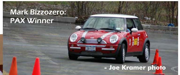
- Joe Kramer photo