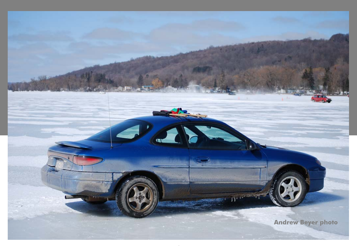
When you work the course at an ice race, the flag station may turn out to be your own car!