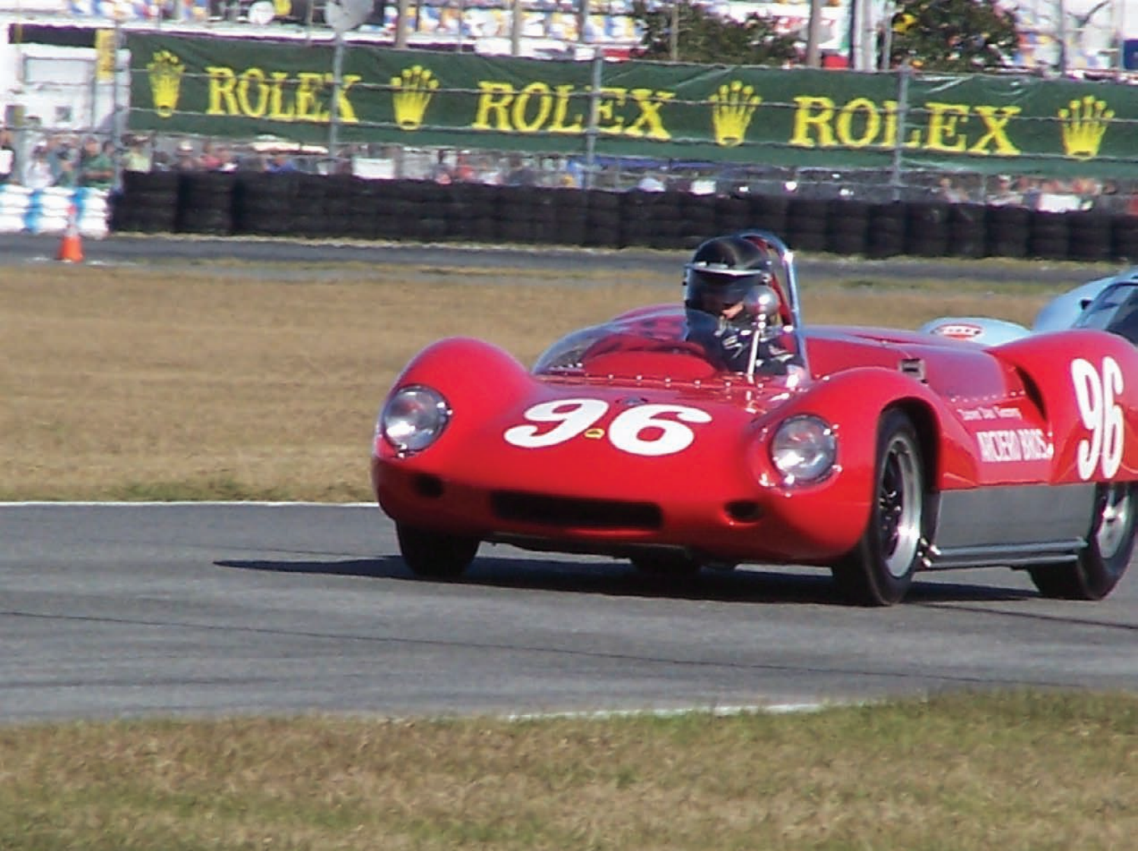
#96 Lotus / Ford Driven to the Daytona win in 1962