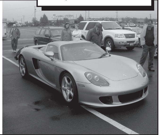
Mercedes SLR McLaren and Porsche Carrera GT in the Vintage Grand Prix paddock at the Glen