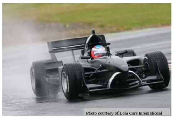
Current supplier to LOLA CARS INTERNATIONAL