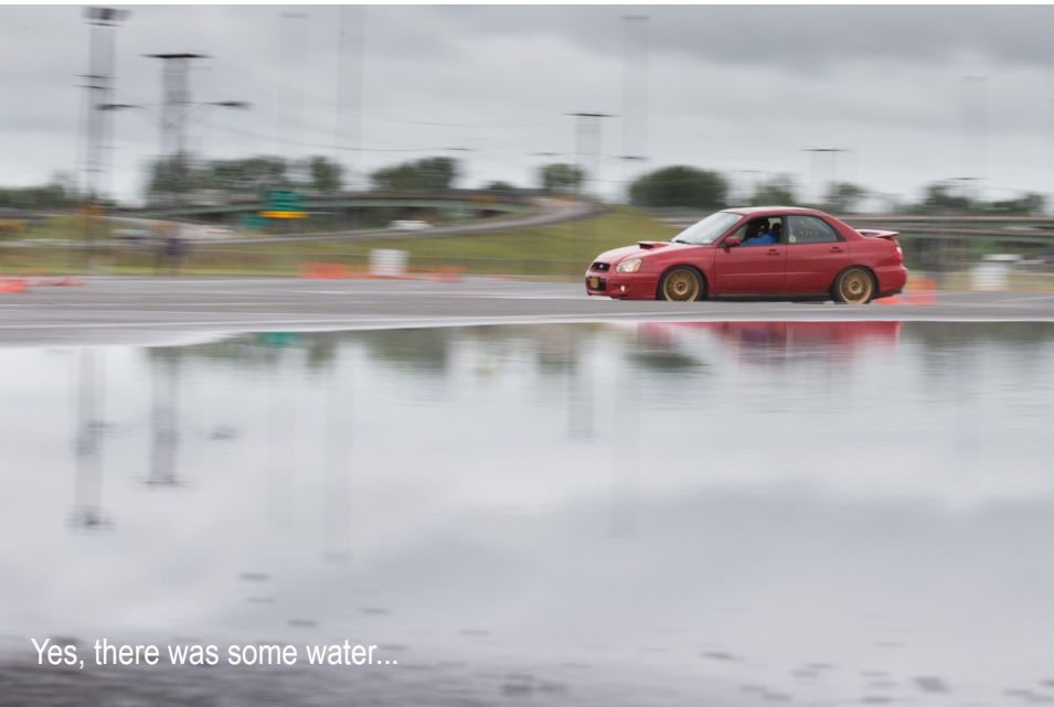
Yes, there was some water...