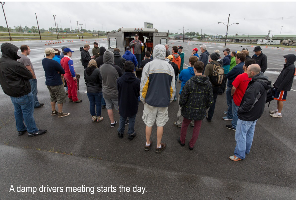
A damp drivers meeting starts the day.

The fourth Central New York Region Solo event was on June 28 th , which was a Sunday. It was at the New York State Fairgrounds. It was an out-of-region event with Finger Lakes Region, so we were hoping to get more drivers than usual.