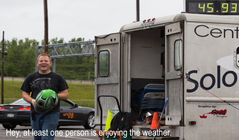
Hey, at least one person is enjoying the weather.