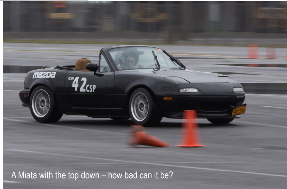
A Miata with the top down – how bad can it be?