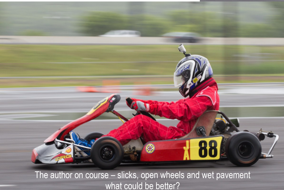
The author on course – slicks, open wheels and wet pavement what could be better?