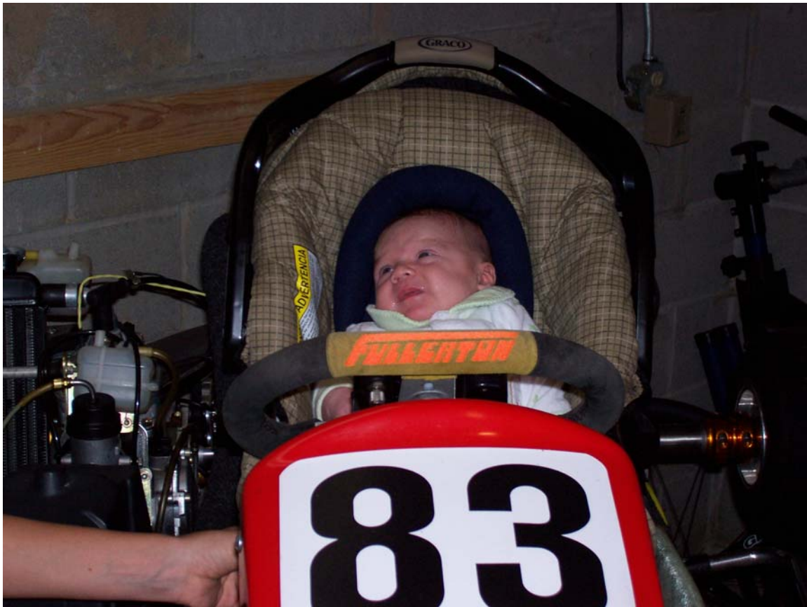
Worlds youngest gokart driver?

A publication of the CNY Region Sports Car Club of America